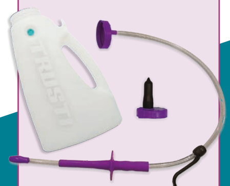
ATT02A Trusti Tuber XS Starter Kit (Generation 2)

A smaller diameter tube for premature or very small calves (<25kg). Purple in colour to differentiate from the standard size.