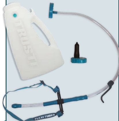
ATT01A Flexi Tuber Starter Kit (Generation 2)

The Trusti Tuber plus a strap that can be placed behind the calf's ears, securing the mouthpiece for the hand-free operation.