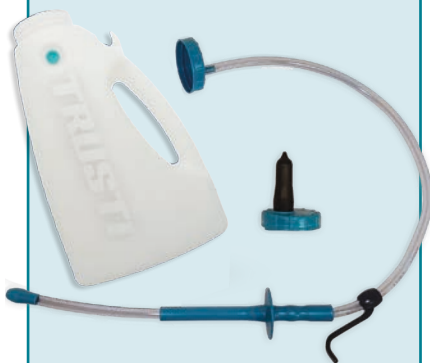
ATT01A Trusti Tuber Starter Kit (Generation 2)

The original Trusti Tuber. Transparency of flexible tube makes it easy to monitor milk flow, and to clean.