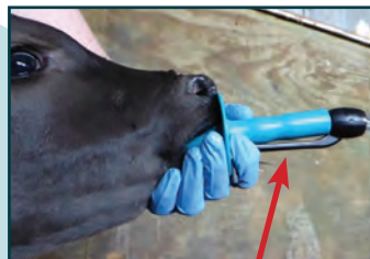
Finger hook on stopper to maintain tube position during feeding.

Do not underestimate calf size as it is better to pass the tube farther than not far enough. If feeding a group of calves we recommend you set the stopper position to the largest calf in the group.