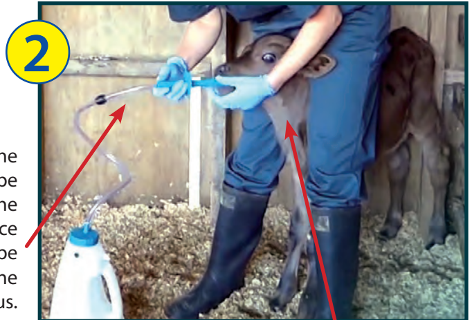
Pass the flexible tube through the mouthpiece so tube enters the oesophagus.