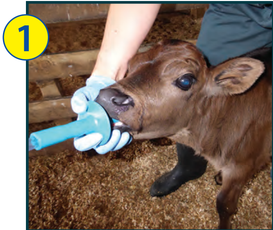
The mouthpiece sits comfortably against the muzzle.