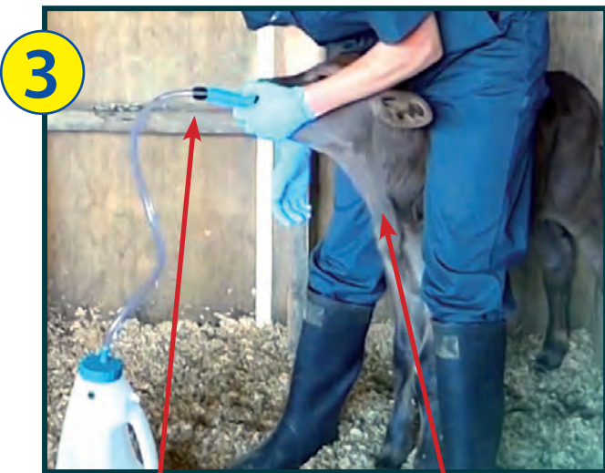
Stopper and calf size guides for easy positioning.