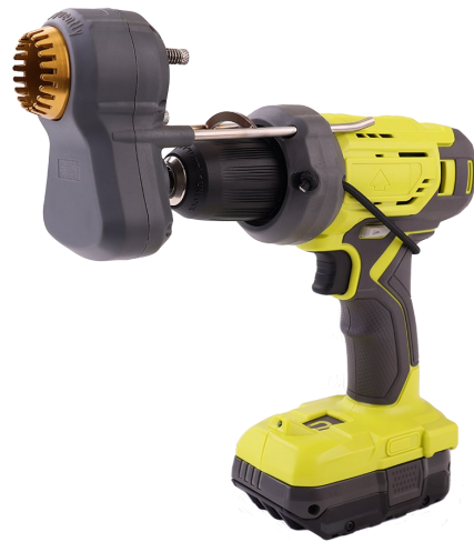
TTT01T Tailwell Tail Trimmer Titanium Head Heavy duty for sand contamination