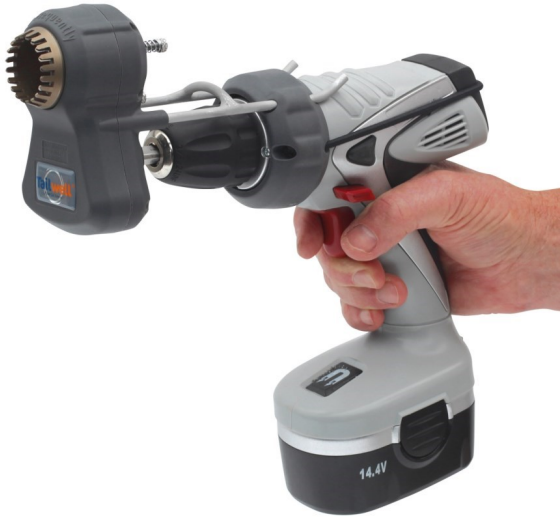
GGC03A Tailwell Tail Trimmer Standard Head Can be resharpened

Telephone: 01948 667676 email: info@dairyspares.co.uk www.dairyspares.co.uk