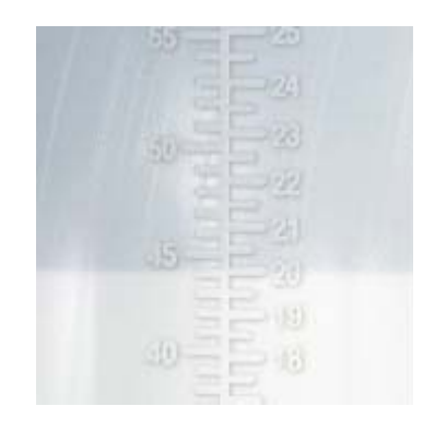
Clear to read Graduated Scale Kg & lbs