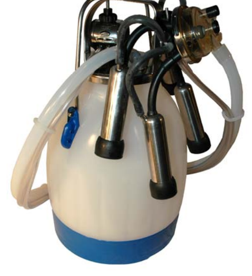
DB005 Eco Milk Bucket