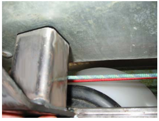
The DB29 bracket is spaced to permit unimpeded operation of the control cords.