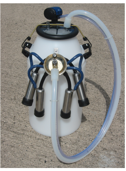
DB52 36ltr Milking Bucket