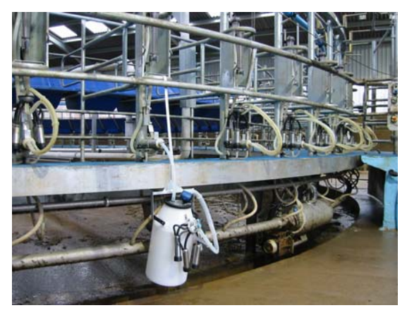
The DB28 bracket positions the bucket to allow it to pass underneath the entry bridge.

Telephone: 01948 667676 Facsimile: 01948 666505 email: sales@dairyspares.co.uk