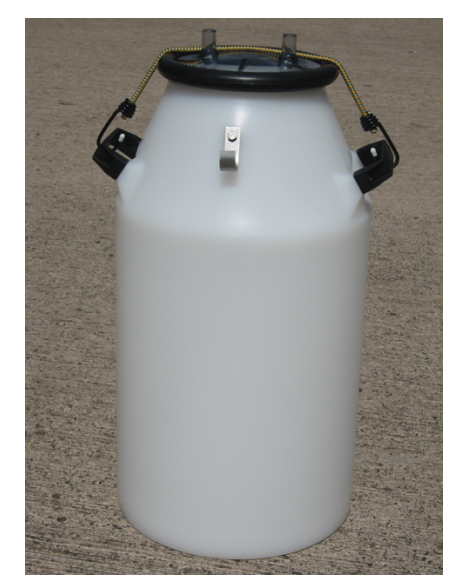
DB18A 36ltr Dump Bucket