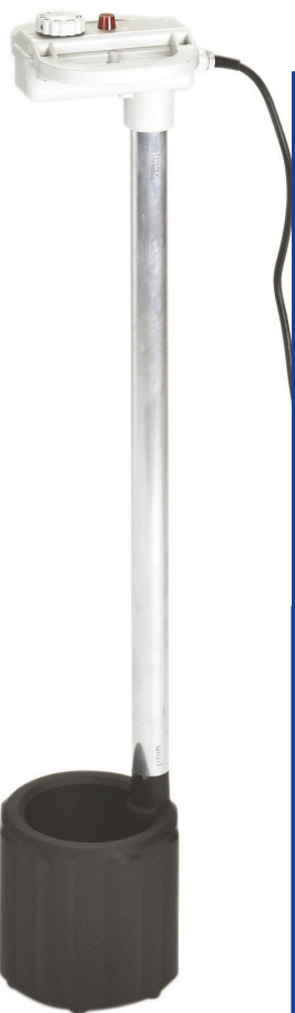
The grey twin handle milk warmer with a black PTFE coated element.