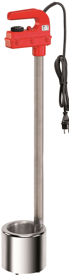
The red hook handle milk warmer with a shiny aluminium coated element.