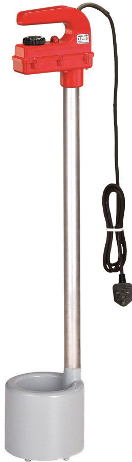
The red hook handle milk warmer with a grey acid resistant coated element.