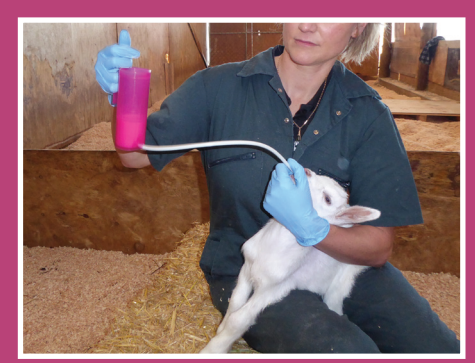
Step 3 - Raise vial