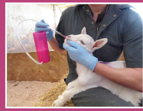
Step 1 - Pass tube