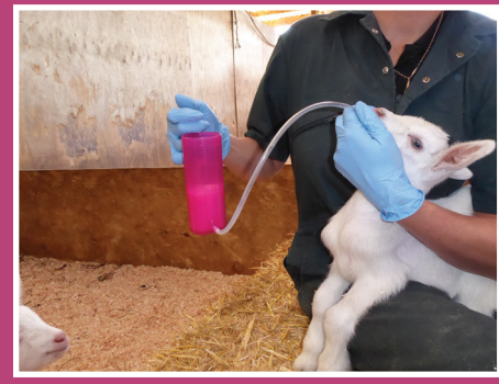
Step 2 - Hold tube in position